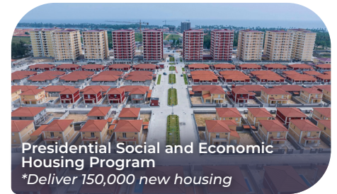
Presidential Social and Economic Housing Program *Deliver 150,000 new housing