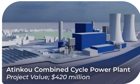
Atinkou Combined Cycle Power Plant Project Value; $420 million