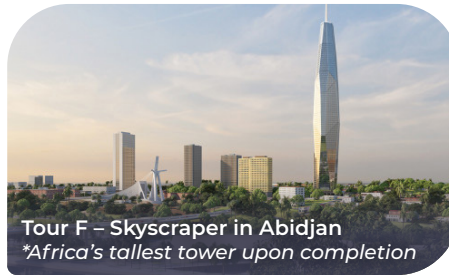
Tour F – Skyscraper in Abidjan *Africa's tallest tower upon completion